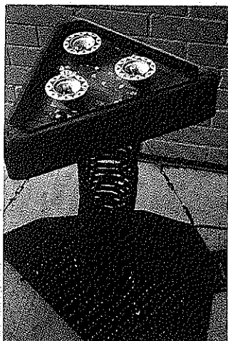
Alan Giddy Untitled Interface 1992