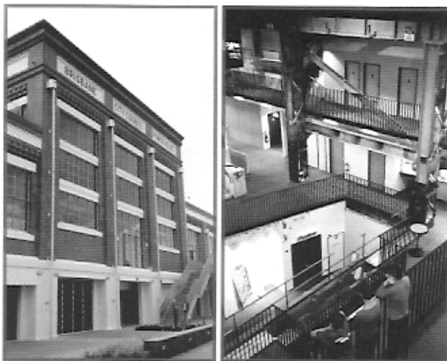
The Powerhouse, Brisbane

"...an info surge!" (Megan Rainey, Adelaide)